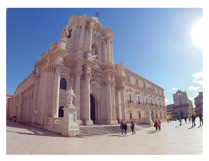
Fig. 3.7 Syracuse, Temple of Athena converted into the Cathedral (late seventh century)

of municipal officials until the eighth century ( defensor civitatis and a pater civitatis ) (Brown 1984, 23).